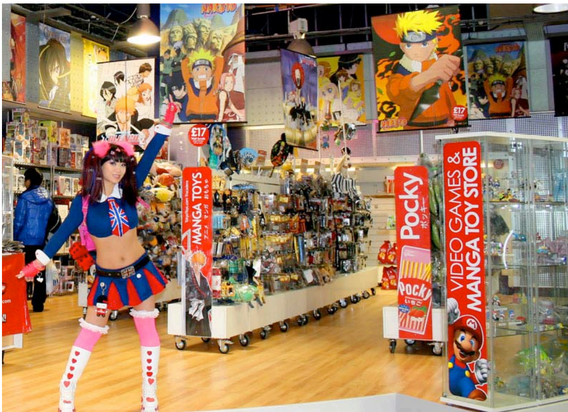
Merchandise from major anime stores in New York, at the fun “cosplay café”

The PJ “mini” Pop will introduce the abundance of the Japanese pop culture to local families, residents, students and communities. Longtime anime fans and New Yorkers interested in learning more about Japanese culture will enjoy the PJ-POP experience.